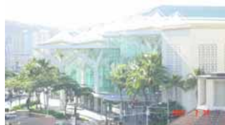
Venue of the convention