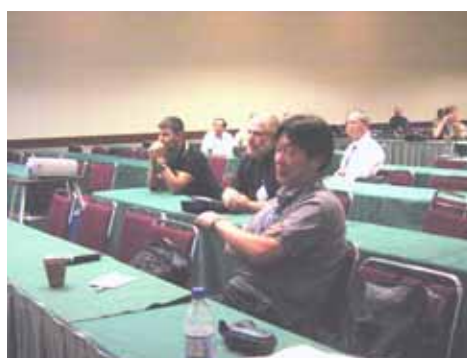
Audience of the session