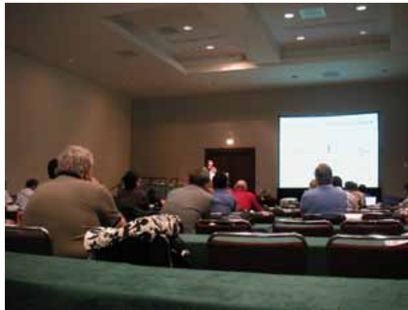
A scene of workshop