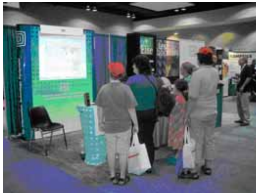
VCCI exhibition booth area