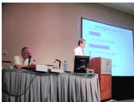
A scene of presentation

Approximately 60 people attended the session in spite that it was programmed as the last item of technical sessions. This fact implies that state-of-the-art technology of Japan and its direction in the field of EMC is paid close attention to.