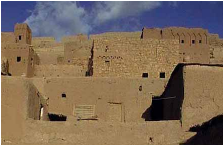
House built with sun-dried bricks